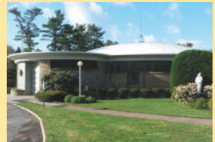
Saint Thecla's Church