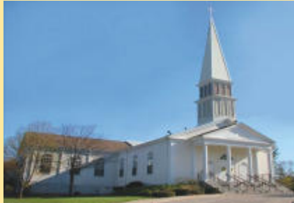
Saint Mary of the Sacred Heart