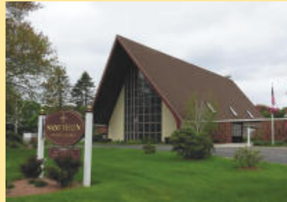
Saint Helen, Mother of the Emperor Constantine