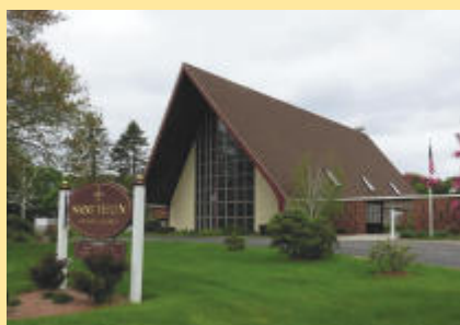
Saint Helen, Mother of the Emperor Constantine