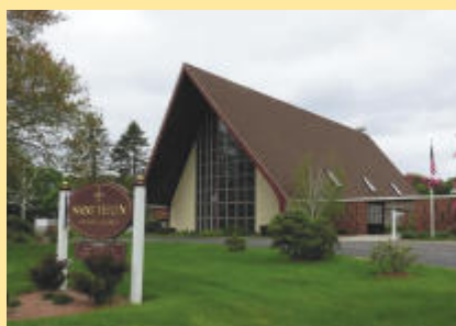
Saint Helen, Mother of the Emperor Constantine