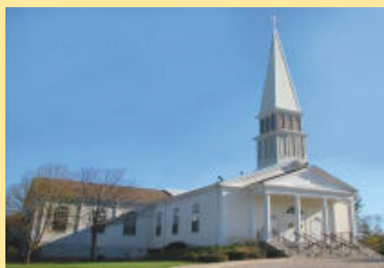
Saint Mary of the Sacred Heart