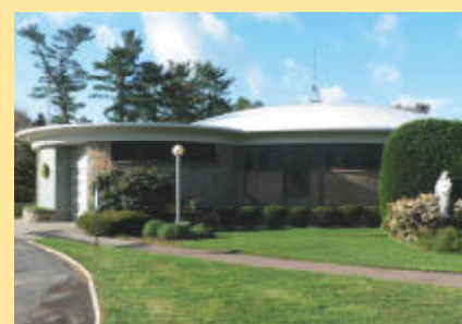
Saint Thecla's Church