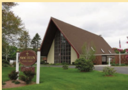
Saint Helen, Mother of the Emperor Constantine