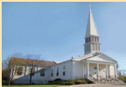
Saint Mary of the Sacred Heart