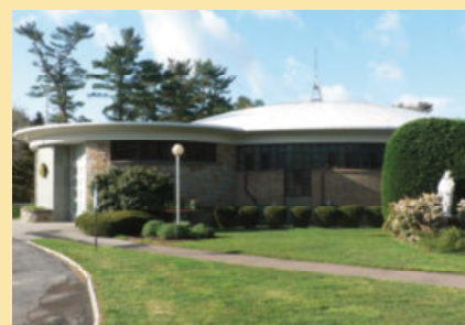
Saint Thecla's Church