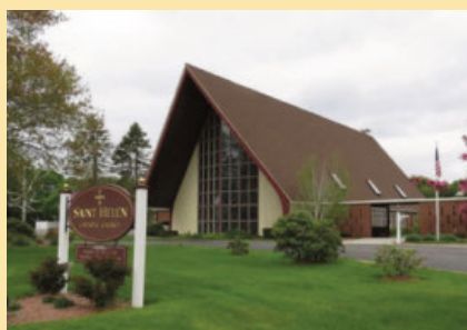
Saint Helen, Mother of the Emperor Constantine