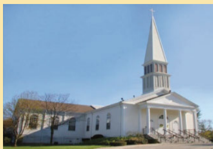
Saint Mary of the Sacred Heart