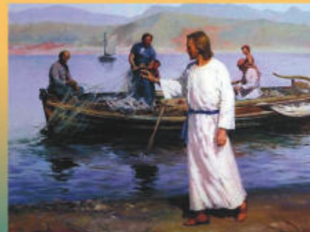
3 rd Sunday: Ordinary Time

Taco kits Taco seasoning Flavored rice Hamburger helper etc Chef Boyardee/ravioli etc Shelf stable milk Dried fruits & nuts