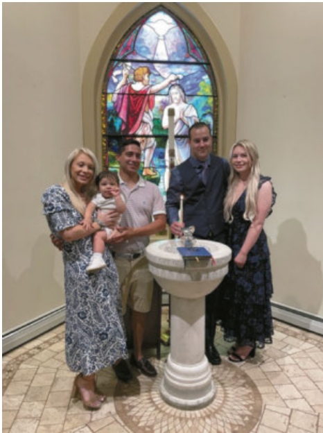
Sunday, June 26th, 2022 at Good Shepherd Church.