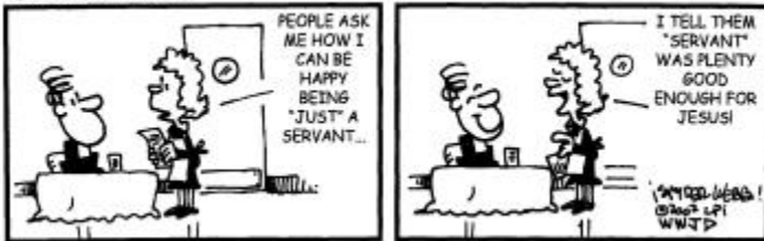
BAPTISM OF OUR LORD