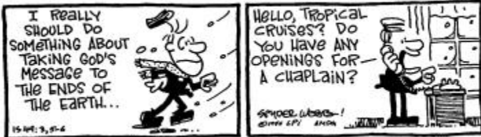
2 nd SUNDAY IN ORDINARY TIME