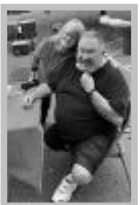
August 29, 2021