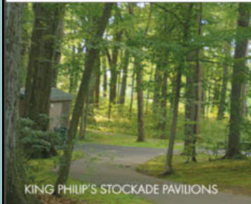
KING PHILIP'S STOCKADE PAVILIONS

we're here to help you choose which stunning venue will set the stage to help make your wedding day magical and unique!