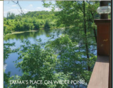
EMMA'S PLACE ON WILDER POND