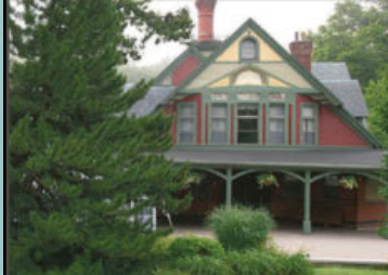
THE CARRIAGE HOUSE AT THE BARNEY ESTATE