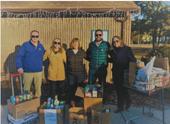
A big shout out to the McMahon Agency of Ocean City for their generous donations to the SMK food pantry!