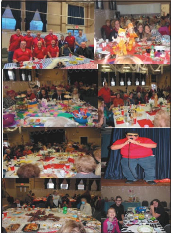
Thank you to all who came out to support QAP's Annual Harvest Tea. A special thank you to those who sponsored tables and provided excellent food and drink for all of their guests. This year 90 people attended to help raise money for the Marian Award Scholarship Fund.