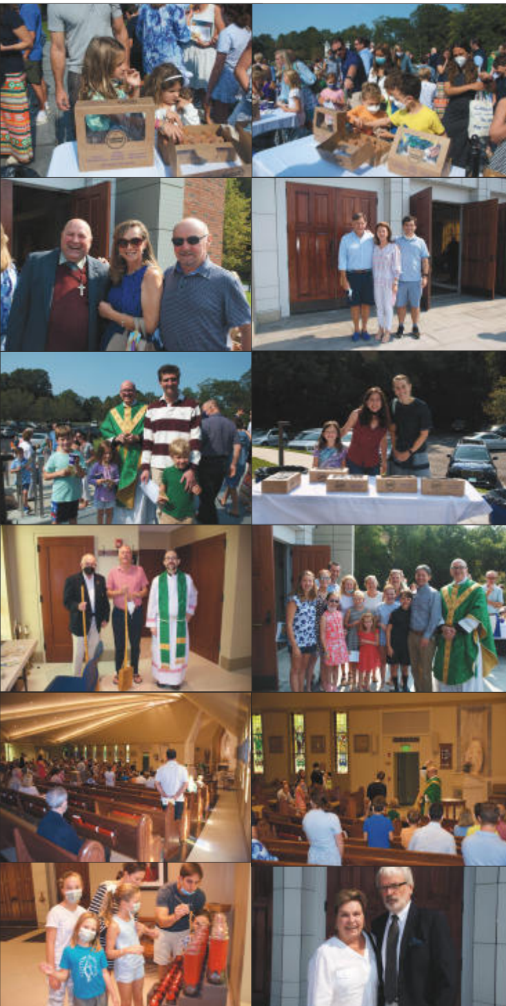
Cover: Communion of the Apostles by Luca Signorelli (1512)