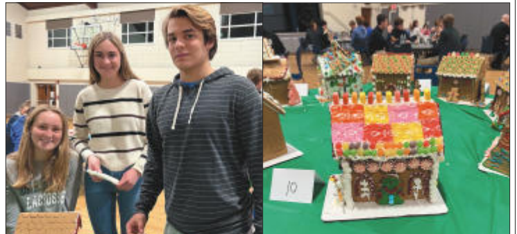
All pictures at stmdarienct.org/youthgroup