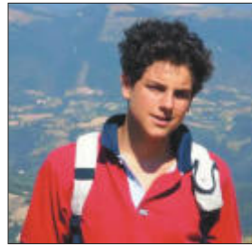
EXHIBIT ON EUCHARISTIC MIRACLES