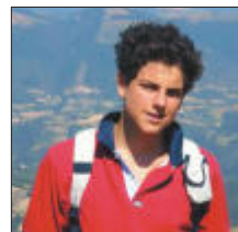
EXHIBIT ON EUCHARISTIC MIRACLES

Blessed Carlo Acutis, the Italian 15-year-old who documented Eucharistic miracles around the world before dying of leukemia, is cause for sainthood before the Vatican. Because of his intense love of the Blessed Sacrament, he used his computer skills to document Eucharistic miracles throughout the centuries. He spent four years on the