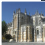
Monastery of Santa Maria da Vitória, Batalha, Portugal