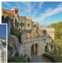
Pena National Palace, Sintra, Portugal

Pilgrimage Price: $3,599 per person double Single Supplement $750