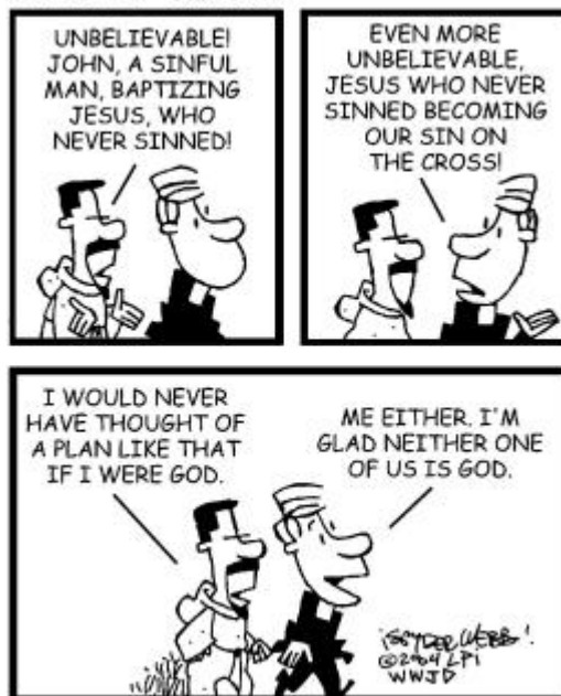
BAPTISM OF THE LORD

A Rosary Rally will be held in front of St. Sebastian Church in Middletown on January 22, 2022 at 12 noon. Everyone is invited to attend. The Rosary will be prayed in defense of the unborn. Life is a gift and our children (our gifts) are our greatest blessing. The rally will be held rain or shine.