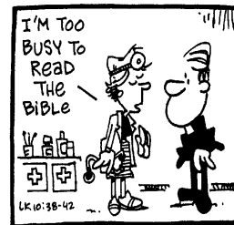
16TH SUNDAY IN ORDINARY TIME