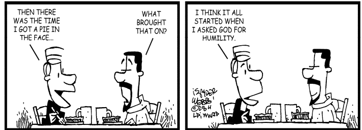
17TH SUNDAY IN ORDINARY TIME