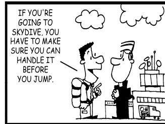
23rd SUNDAY IN ORDINARY TIME