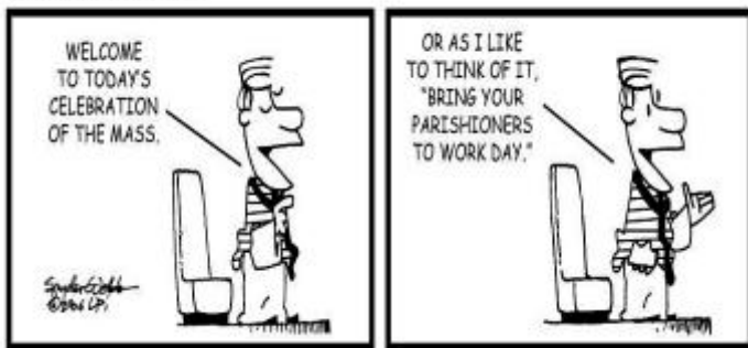
2nd SUNDAY OF EASTER