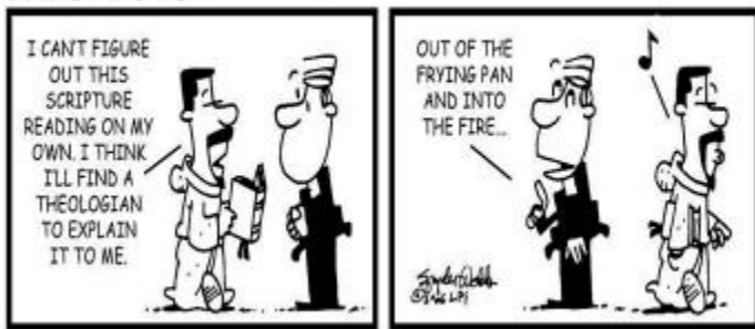
3rd SUNDAY OF EASTER

A parishioner known by the pastor or registered with the parish for three months can receive a letter of recommendation stating their eligibility to become a godparent in a baptism or a sponsor for a confirmation in another parish.