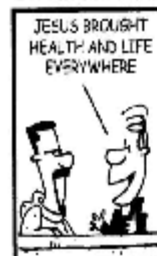
18TH SUNDAY IN ORDINARY TIME

We are looking for parishioners to help us welcome new people to the parish! If you are interested in helping with hospitality, please email us.