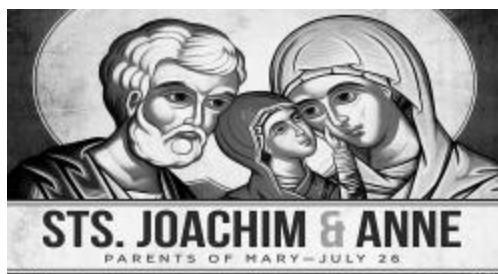
17TH SUNDAY IN ORDINARY TIME