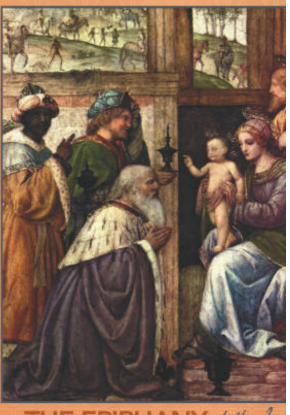
"Since from you shall come a ruler, who is to shepherd my people Israel." - w 200

Jueves del mes. Asambleas generales de Predicas, Alabanzas y Adoración