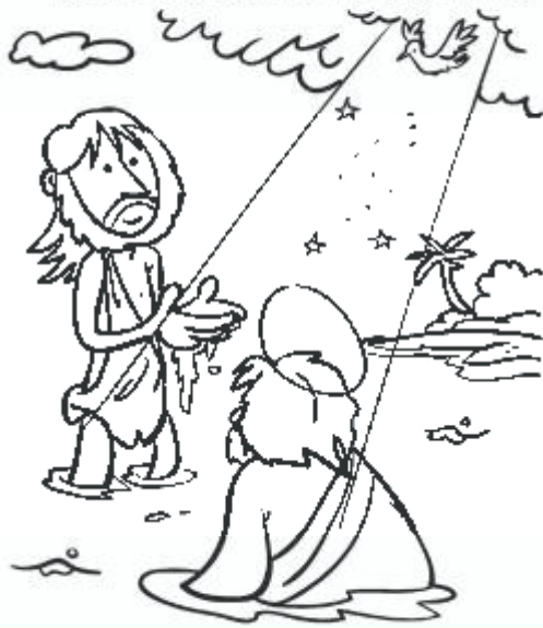
Baptism of the Lord • Luke 3:15-16, 21-22

Read the Gospel of the week and color the image.