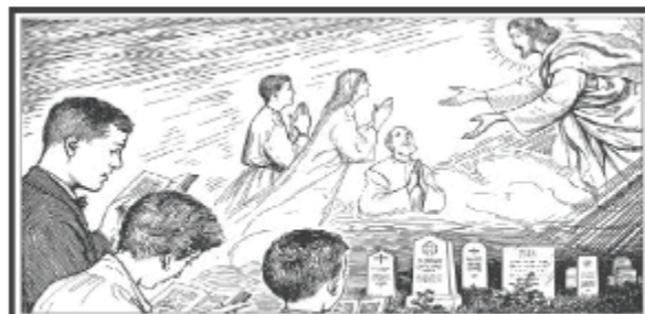
PRAYERS IN TIME OF SICKNESS AND DEATH

Sickness and pain have always been a heavy burden for man and an enigma to his understanding. Christians suffer sickness and pain as do all other human beings; yet their faith helps them to understand better the mystery of suffering and to bear their pain more bravely. From Christ's words they know that sickness has meaning and value for their own salvation and for the world's; they also know that Christ loved the sick and that during His life He often looked upon the sick and healed them.