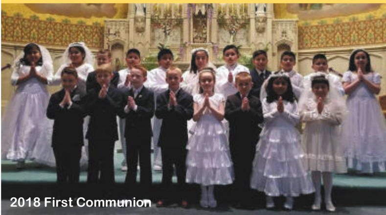
2018 First Communion