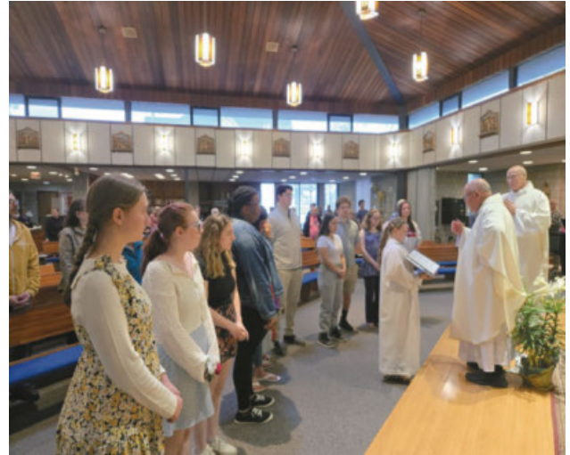
"Blessing of the Brains"

The Newman Association would like to thank all the parishioners who donated wonderful meals for their meetings on Sunday nights..