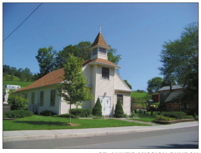
ST. ANNE'S MISSION CHURCH 375 Main Street, Andes, NY 13731 All Correspondence: Sacred Heart Parish, Margaretville NY

<u>Parish Email</u> shcatholicchurch@icloud.com