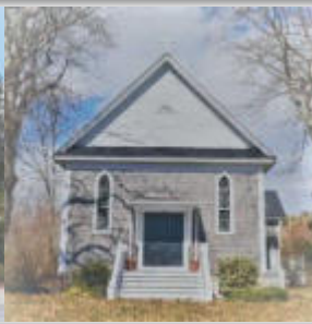
ST. JOSEPH CHAPEL