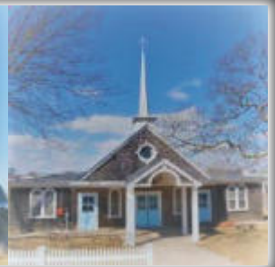
ST. THOMAS CHAPEL

Main Office Address: 167 East Falmouth Hwy., East Falmouth, MA 02536