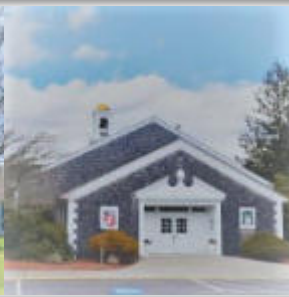
ST. ELIZABETH SETON