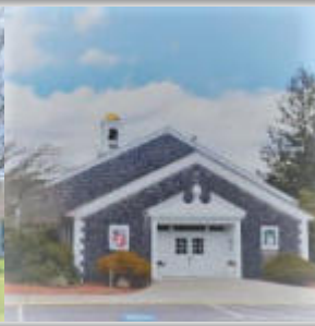
ST. ELIZABETH SETON