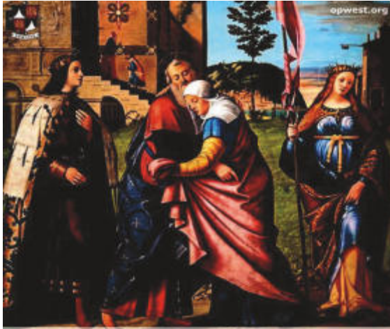
St. Joachim and St. Anne