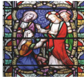
Stained Glass Window Depicting The Canaanite Woman who came Seeking Healing for her Daughter, Matthew 15:28

After consideration of other sources of parish income, we need $3,836.00 from our weekly collections to meet parish expenses. Our Bishop's Appeal Assessment is $30,200.00