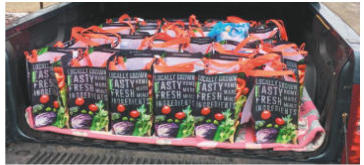
Load of HC 2021 Christmas Food Baskets ready to be delivered!

God Our Father, Your Son, Jesus Christ, is "the way, the truth and the life" and His Holy Cross is the bridge of Mercy. Help us, your servants to build a bridge of nourishment to the hungry, a bridge of comfort to the suffering, a bridge of welcome to the lonely, a bridge of collaboration to the our sister parish, and a bridge of faith to all people through Your Sacraments. For You live and reign for ever and ever. Amen. Our Mother of Sorrows pray for us. +