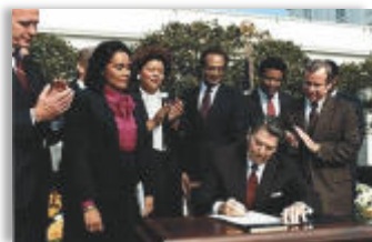
Ronald Reagan and Coretta Scott King at the Martin Luther King Jr. Day signing ceremony

The campaign for a federal King holiday began soon after his assassination in 1968. President Ronald Reagan signed the holiday into law in 1983, and it was