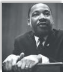
Dr. King in 1965

Martin Luther King Jr. Day (officially Birthday of Martin Luther King, Jr., and sometimes referred to as MLK Day) is a federal holiday in the United States. It marks the Rev. Dr. Martin Luther King Jr.'s birthday and is observed annually on the third Monday of January.