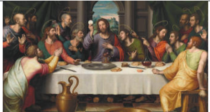
The Last Supper 16th-century Juan de Juanes