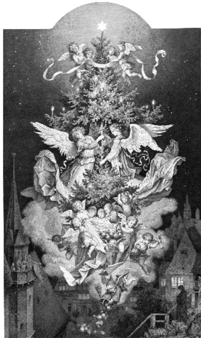
Shown is the wood engraving "Die Christnacht" by Ludwig Richter, 1854.

"Our Saviour, dearly-beloved, was born today: let us be glad. For there is no proper place for sadness, when we keep the birthday of the Life, which destroys the fear of mortality and