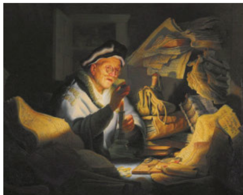
THE PARABLE OF THE RICH FOOL BY REMBRANDT, 1627

In today's Gospel reading, Jesus teaches the disciples about being vigilant and faithful with the gifts God has given us as we await the end times and return of Jesus. How well do you think you are stewarding the gifts God has given you?