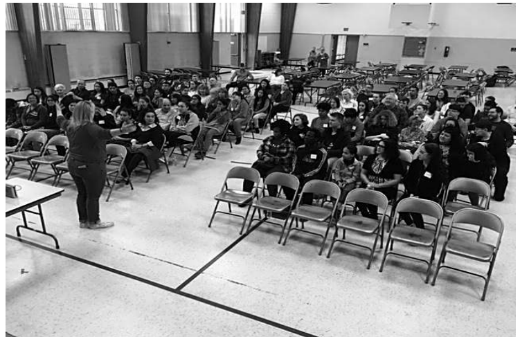
Confirmandi of our parish and St John's Parish, Dunellen, NJ, at the Confirmation Retreat at Guardian Angels