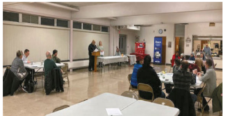
Synod listening session at Our Lady of Fatima, Piscataway, on Thursday, February 24.