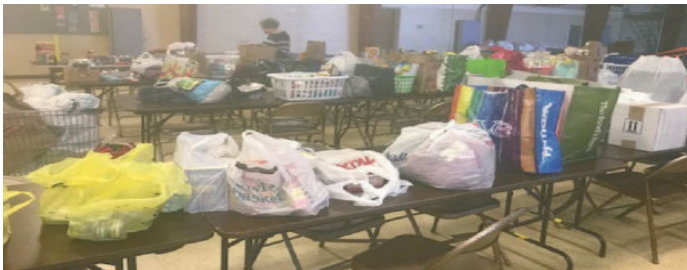
40 days of lent, 40 items almsgiving. Thank you for your generosity.