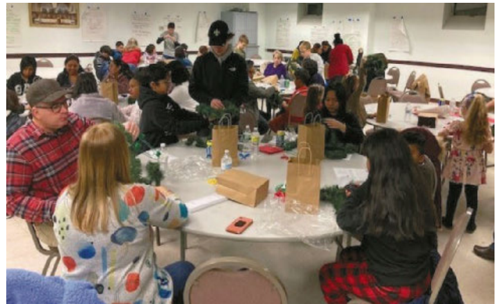
Advent Wreath Making by Religious Education students and their parents