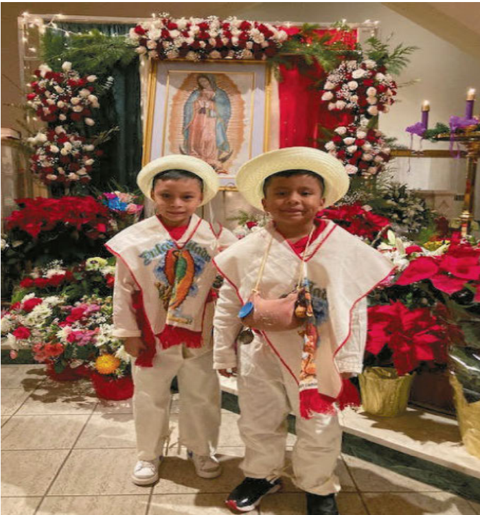
Festividad de Nuestra Señora de Guadalupe en la Iglesia de San Pablo el Apostol

Cualquier feligrés que esté enfermo, envejecido o incapacitado puede recibir la eucaristía en casa. Por favor llame a la oficina de la parroquia.