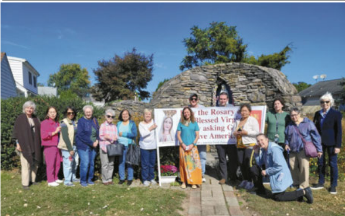
Rosary Rally on 10/13 at Guardian Angels Grotto

Rosary Altar Society monthly meeting will take place in the Guardian Angels Church Hall on Sunday, November 3 rd after the 11:00 a.m. Mass. All Parishioners over the age of 21 are welcome to join us.