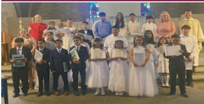
Congratulations to the students who received First Communion on Sunday, June 1 st

CONGRATULATIONS TO THE CLASS OF 2025! May God guide you along your life!