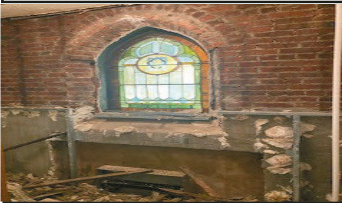
St. Paul's Church Repair in the Confessional