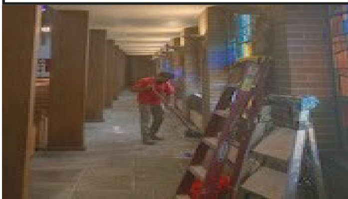
Repairs at Guardian Angels