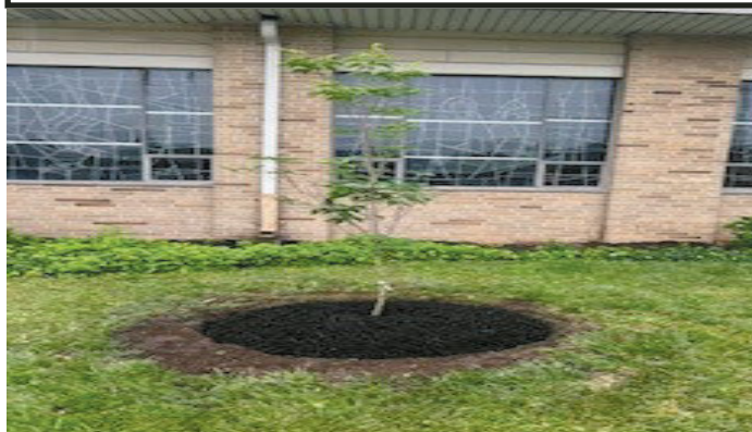
New Dogwood Tree at Guardian Angels

The Second Collection scheduled for the weekend of June 28-29 is for Peter's Pence Collection . This collection is The Annual Holy Father's Collection and all proceeds are designated for that singular purpose.